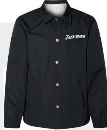
NYLON SCRIPT JACKET