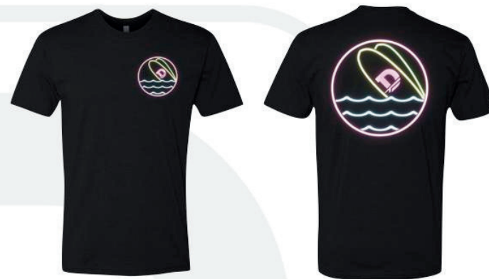
NEON SIGN TEE