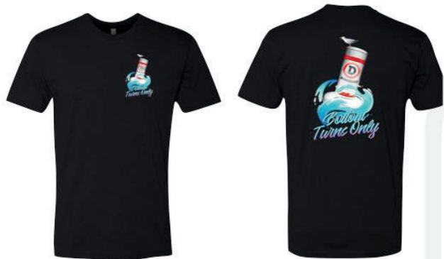
BOTTOM TURNS ONLY TEE