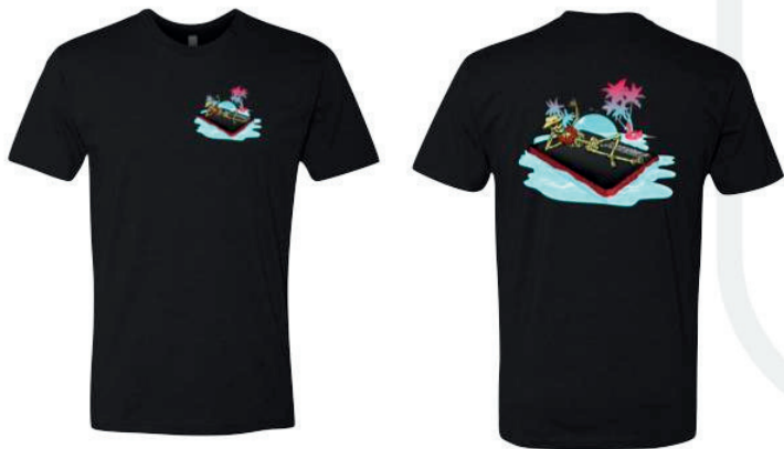
SKELETON ON THE DOCK