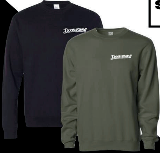
SCRIPT CREW NECK